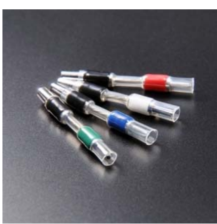
La Source 101 Long headshell leads