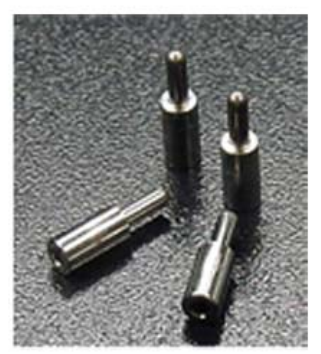
Male Terminals 1.2mm Dia.