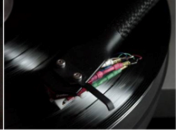
La Source 102 Short Headshell Leads