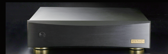
Upgraded equalizer featuring a sophisticated power supply

The DS-W2 equalizer houses 12 large capacitors, each with 56000µF capacity; more than those normally found in a phono pre-amplifier. In use, the benefits of this design choice are obvious, with fantastic musical control and an effortless presentation. A 1.5mm thick pure copper plate bus-bar is employed to connect these capacitors, ensuring maximum power transfer. This also functions as a shielding plate for the transformer, revealing more low-level musical detail. All of the improvements of the DS-W2 equalizer have created a component three times larger than the predecessor DS-W1, and sonic performance is of an even greater magnitude. The result is ultimate enjoyment from your record collection. Expect to hear more from DS Audio.