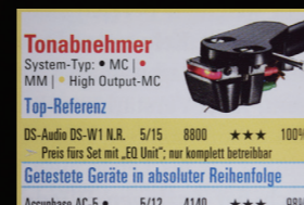
World beating optical cartridge technology

The DS-W2 is the successor to our DS-W1 optical cartridge design, which was awarded the title of world's best phono cartridge by two major audio magazines in Germany: Stereo and Audio. This praise helped to establish the popularity of our unique technology, setting a high standard and paving the way for further development. The extensive advancements and refinements of the DS-W2 design have resulted in performance that is far in excess of the already impressive DS-W1.