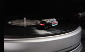
Boron Cantilever with Micro-ridge stylus

The DS-W2 is the successor to our DS-W1 optical cartridge design, which was awarded the title of world's best phono cartridge by two major audio magazines in Germany: Stereo and Audio. This praise helped to establish the popularity of our unique technology, setting a high standard and paving the way for further development. The extensive advancements and refinements of the DS-W2 design have resulted in performance that is far in excess of the already impressive DS-W1.