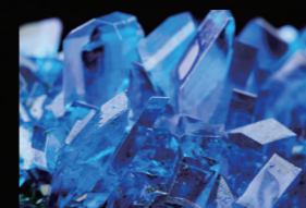
Aluminum Cantilever with Shibata stylus

DS002 has a wire suspension mechanism which is the same design as DS Master 1 and DS-W 2. By implementing it, you realize high channel separation and stable music playback. Moreover, by arranging the position of the slit at the position close to the needle point, it is possible to retrieve information with higher freshness.