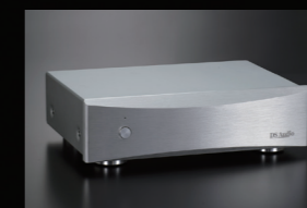
Enhanced power supply circuit

When designing the DS 002, we carefully evaluated each component of the preamp/equalizer. The updated power supply is a key part in the new design. To ensure a high-quality power source for the preamp/equalizer, ten 33000µF capacitors are used, providing effortless power for the highest level of sound quality.