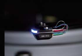
Using vibration system of the same design as DS Master 1 and DS-W2

DS002 has a wire suspension mechanism which is the same design as DS Master 1 and DS-W 2. By implementing it, you realize high channel separation and stable music playback. Moreover, by arranging the position of the slit at the position close to the needle point, it is possible to retrieve information with higher freshness.