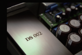
Add shield mechanism

When designing the DS 002, we carefully evaluated each component of the preamp/equalizer. The updated power supply is a key part in the new design. To ensure a high-quality power source for the preamp/equalizer, ten 33000µF capacitors are used, providing effortless power for the highest level of sound quality.